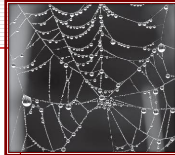
Water drops on a spider web.

7. Identify two manifestations (i.e., visual evidence) of surface tension?